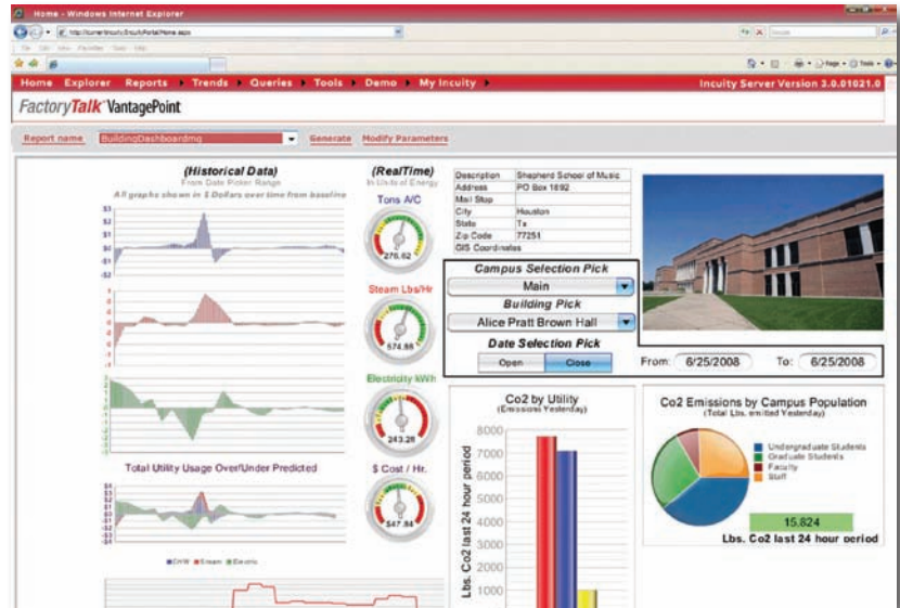
Typical Dashboard Created in FactoryTalk VantagePoint

Now there's FactoryTalk® VantagePoint. Easier to install. Easier to use. Easier to own.