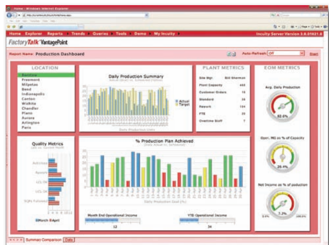
Dashboard Elements and Microsoft Excel Charts Mixed on Personalized Content Viewer Page

You can use each pre-configured report as is, or as an example to follow for creating your own. All report elements are reusable, so future needs can easily be accommodated. Report creation could not be easier. Simply drag-and-drop, get it the way you want it, and then publish it with just one click. You can create individual ad hoc reports or publish them in combination for users to see in the content viewer. All reports, trends, dashboards